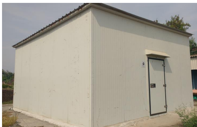
Fig. 5. Controlled storage structure

In controlled onion storage structures, the onions are stored at 0-5°C and 60-65% RH that leads to much lesser losses as compared to ventilated storage structure. The cost of construction (approx. 20-25 lakhs/ 20 tons) and running cost (i.e. Rs 0.60-0.65/ Kg/ month) are very high as energy required to maintain the storage facility in the temperature range of 0-5°C is high. The other problems are condensation and require lot of energy and time. The bulbs start sprouting immediately after they are removed from the cold storage.