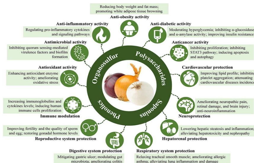
Fig.2. Health benefits of onions