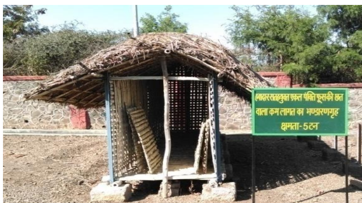
Fig. 3. Low volume structure