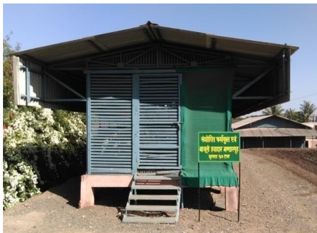
Fig. 4. High volume structure

These current prevailing structures that may vary in their capacity as well as the cost to fulfil the requirements of all income groups of farmers/traders. Though these naturally ventilated storage structures are well adopted, still considerable losses occur as there is no control of temperature, relative humidity and airflow which are very important for successful storage of onion with minimum losses. The construction of the 50 MT double row modified bottom and side ventilated storage structure needs approximately Rs. 7 lakhs.