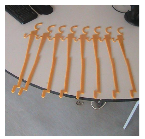
The first 8pieces of the model